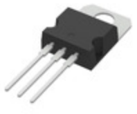
BTA12-700BWRG STMicroelectronics TRIAC ALTERNISTOR 700V TO220AB