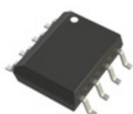
AD7893ARZ-5REEL7 Analog Devices Inc. IC ADC 12BIT SAR 8SOIC