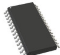
AD73322LARUZ-REEL Analog Devices Inc. IC AFE 2 CHAN 16BIT 28TSSOP