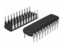
ATF16V8CZ-15PC Microchip Technology IC PLD 8MC 15NS 20DIP