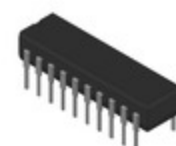
ATF16V8CZ-15PC Atmel FLASH PLD, 15NS, PAL-TYPE, CMOS