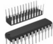
ATF20V8B-10PU Microchip Technology IC PLD 8MC 10NS 24DIP