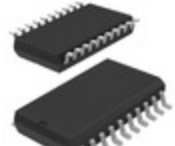
ATF16V8C-7SU Microchip Technology IC PLD 8MC 7.5NS 20SOIC