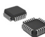
ATF20V8B-15JC Microchip Technology IC PLD 8MC 15NS 28PLCC