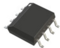
ADA4077-2ARZ-R7 Analog Devices Inc. IC OPAMP GP 2 CIRCUIT 8SOIC