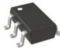
ADA4084-1ARJZ-R7 Analog Devices Inc. IC OPAMP GP 1 CIRCUIT SOT23-5