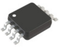
ADA4077-2ARMZ-R7 Analog Devices Inc. IC OPAMP GP 2 CIRCUIT 8MSOP