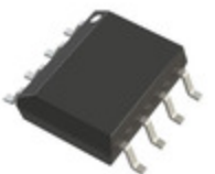
ADA4077-2ARZ Analog Devices Inc. IC OPAMP GP 2 CIRCUIT 8SOIC