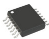
ADA4077-4ARUZ-R7 Analog Devices Inc. IC OPAMP GP 4 CIRCUIT 14TSSOP