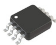
ADA4077-2ARMZ Analog Devices Inc. IC OPAMP GP 2 CIRCUIT 8MSOP