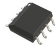
ADA4077-2BRZ Analog Devices Inc. IC OPAMP GP 2 CIRCUIT 8SOIC