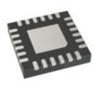
ADN8810ACPZ Analog Devices Inc. IC CURRENT SOURCE 12 BIT 24LFCSP