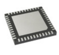
ADN4680EBCPZ Analog Devices Inc. 250MBPS QUAD M-LVDS TRANSCEIVER