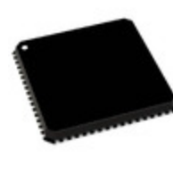
ADN8102ACPZ Analog Devices Inc. IC INTERFACE SPECIALIZED 64LFCSP