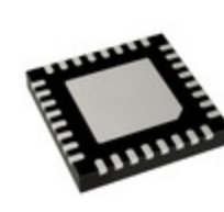
ADN8830ACPZ Analog Devices Inc. IC THERMO COOLER CNTRLR 32-LFCSF