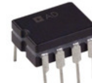
AD829SQ/883B Analog Devices Inc. IC AMP GENERAL PURPOSE 8CERDIP