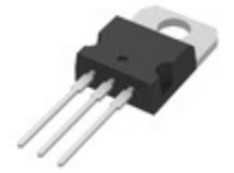
L7812CV-DG STMicroelectronics IC REG LINEAR 12V 1.5A TO220