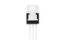
L7812CV UMW 1.2A FIXED 12V~12V POSITIVE 1 35