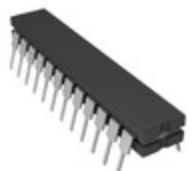
AD7244AQ Analog Devices Inc. IC DAC 14BIT V-OUT 24CDIP