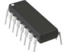
AD7243BN Analog Devices Inc. IC DAC 12BIT V-OUT 16DIP