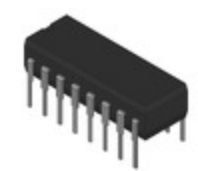
AD7243AQ Analog Devices Inc. IC DAC 12BIT V-OUT 16CERDIP