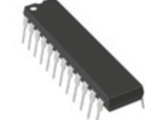
AD7245AANZ Analog Devices Inc. IC DAC 12BIT V-OUT 24DIP