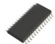
AD7244JRZ Analog Devices Inc. IC DAC 14BIT V-OUT 28SOIC