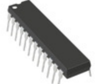
AD7245AAN Analog Devices Inc. IC DAC 12BIT V-OUT 24DIP