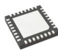
AD7779ACPZ Analog Devices Inc. IC ADC 24BIT SIGMA-DELTA 64LFCSP