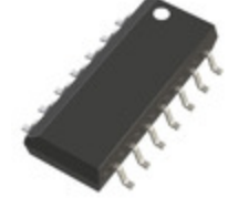
AD7781CRZ Analog Devices Inc. IC ADC 20BIT SIGMA-DELTA 14SO