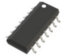
AD7781BRZ Analog Devices Inc. IC ADC 20BIT SIGMA-DELTA 14SO