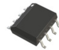
AD8221ARZ Analog Devices Inc. IC INST AMP 1 CIRCUIT 8SOIC