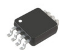
AD8220WARMZ-R7 Analog Devices Inc. IC INST AMP 1 CIRCUIT 8MSOP