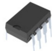
AD7893ANZ-2 Analog Devices Inc. IC ADC 12BIT SAR 8DIP