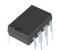
AD7893AN-5 Analog Devices Inc. IC ADC 12BIT SAR 8DIP