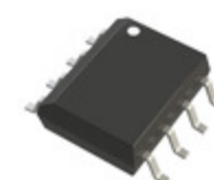
AD7893AR-5 Analog Devices Inc. IC ADC 12BIT LC2MOS 8-SOIC