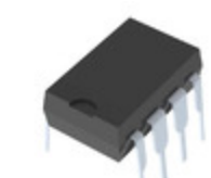
AD7893AN-10 Analog Devices Inc. IC ADC 12BIT SAR 8DIP