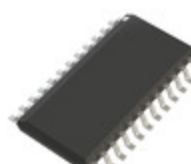
AD7892BRZ-3 Analog Devices Inc. IC ADC 12BIT SAR 24SOIC