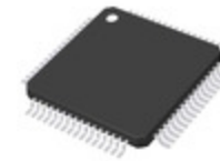
PIC18F67K22-I/PT Microchip Technology IC MCU 8BIT 128KB FLASH 64TQFP