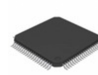
PIC18F8520-I/PT Microchip Technology IC MCU 8BIT 32KB FLASH 80TQFP