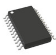
AD7492BRU Analog Devices Inc. IC ADC 12BIT SAR 24TSSOP