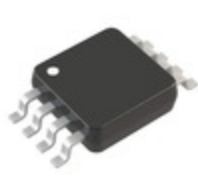
AD7495ARMZ Analog Devices Inc. IC ADC 12BIT SAR 8MSOP