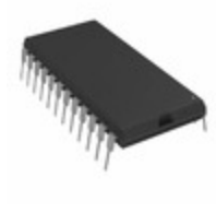
AD75004KN Analog Devices Inc. IC DAC 12BIT QUAD W/BUFF 24-DIP