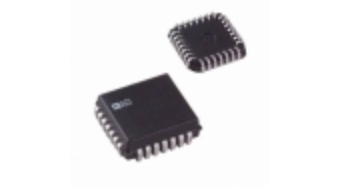
AD75004KP Analog Devices Inc. IC DAC 12BIT V-OUT 28PLCC