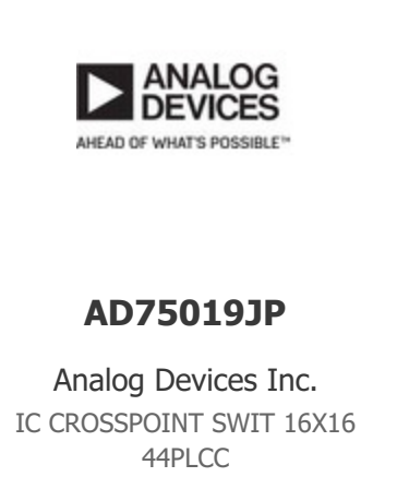
AD75019JP Analog Devices Inc. IC CROSSPOINT SWIT 16X16 44PLCC